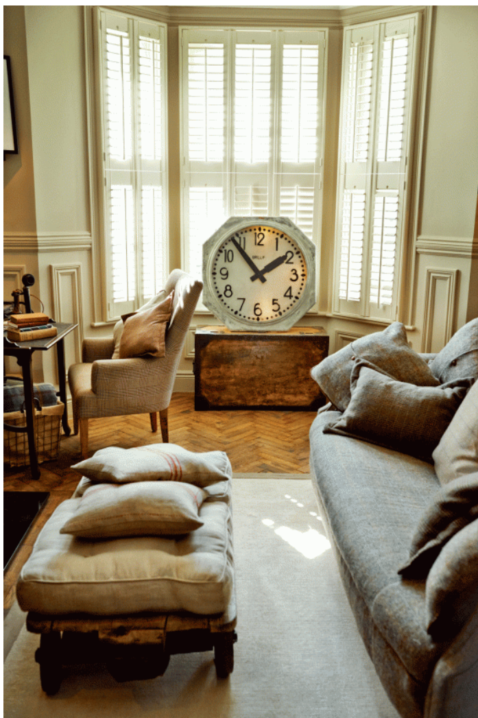
Comfy setting: Gandy furnished the house with items from Gumtree, eBay and Sunbury Antiques Market; fabrics came from Holland & Sherry on Savile Row

Goldsmith resigns in protest over move to back third Heathrow runway 2 hours